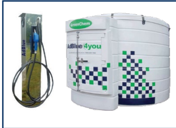
Tanks and dispensing post