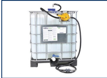
EFFINOX 1000 IBC