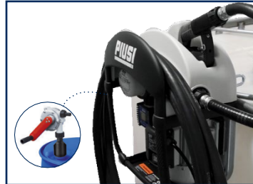
PUMP for your IBC