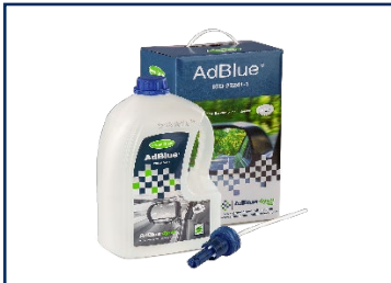
4L AdBlue Starter Kit