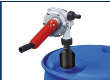
Manual PUMP for your Drum