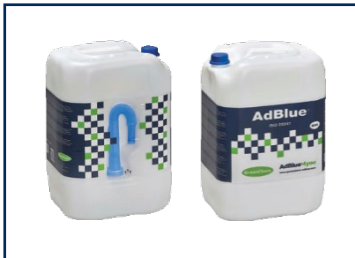
5/10/20L AdBlue® Canisters