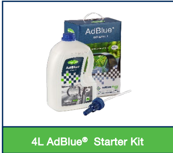
4L AdBlue® Starter Kit