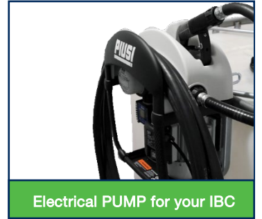
Electrical PUMP for your IBC