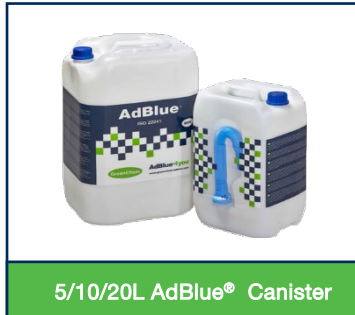
5/10/20L AdBlue® Canister