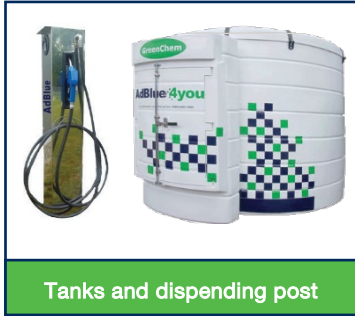
Tanks and dispensing post