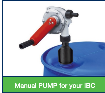
Manual PUMP for your IBC